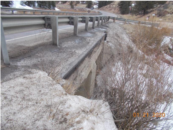
View of bridge I-15-T from the south side.