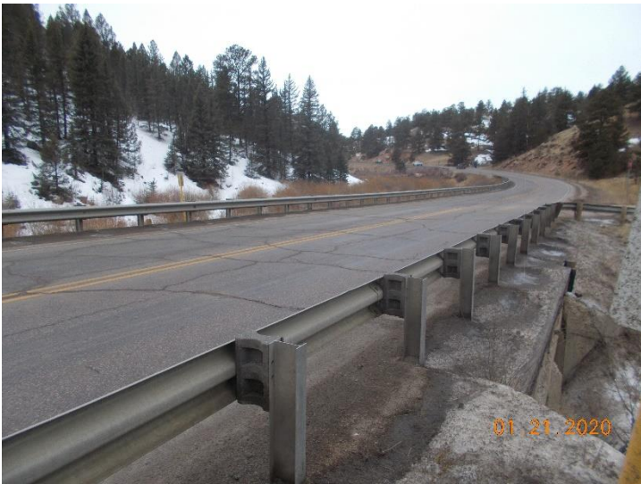
View of bridge I-15-T looking southeast.