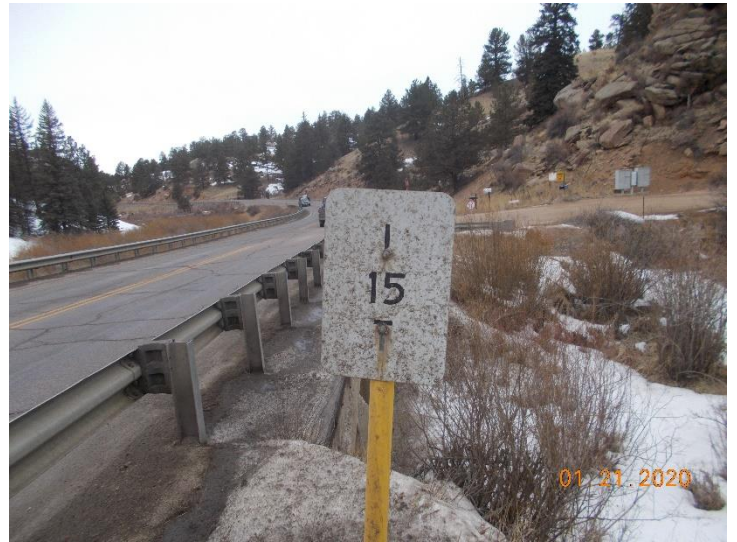
Structure I-15-T signage.